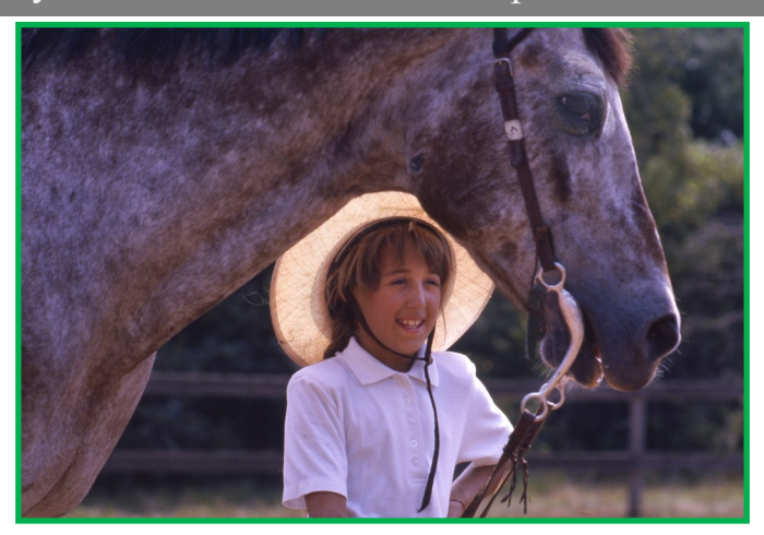
New OPPORTUNITY FOR ALUMS!! Sponsor A Camp Horse For The Summer!.

Help keep horses at HC4H camp, and help children have a hands on Horse Activity experience!.