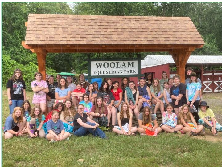
Horse Campers, Staff & Counselors summer 2023

4-H Camp is a place where 4-H principles are valued and personal growth fostered by honoring 4-H Camp traditions while creating new opportunities for all.