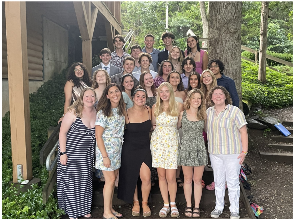
Hartford County 4-H Camp Staff 2023